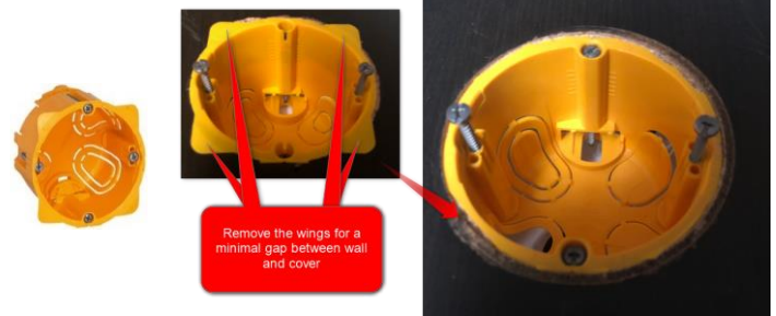
ABB round Hafobox MD4050 and hollow wall boxes (ref HW-50, HW50-G, HW52-F)

Legrand batibox round (ref 080051, 080061, 080052, 080053)